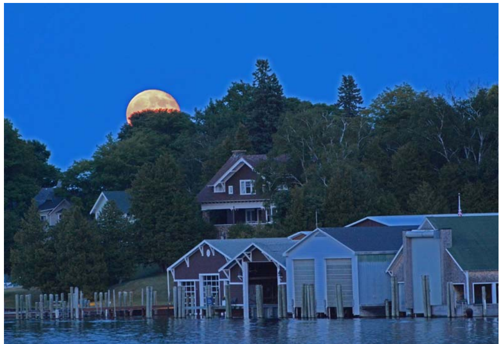
The Charlevoix Photography Club - Full Moon rising downtown Charlevoix, July 2, 2015. Soon after the sun set in the West the Full Moon rose in the East. Four club members showed up at the park above the Beaver Island Boat Company to shoot the..breeze..and snap a couple of time exposures.

No parking in front of Foster Boat Works until August 1 !